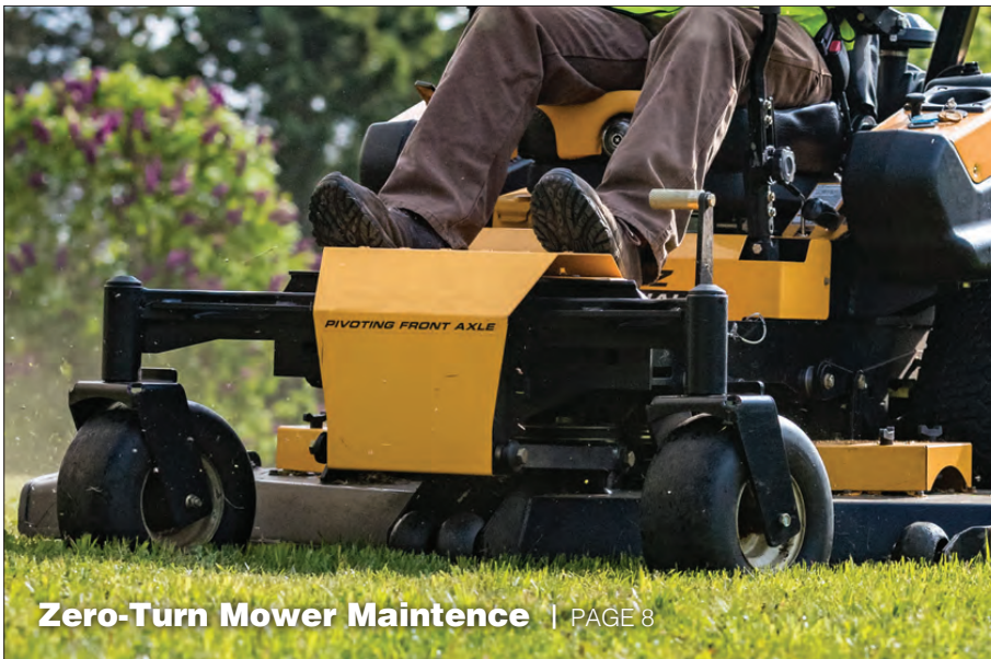
Zero-Turn Mower Maintenance | PAGE 8